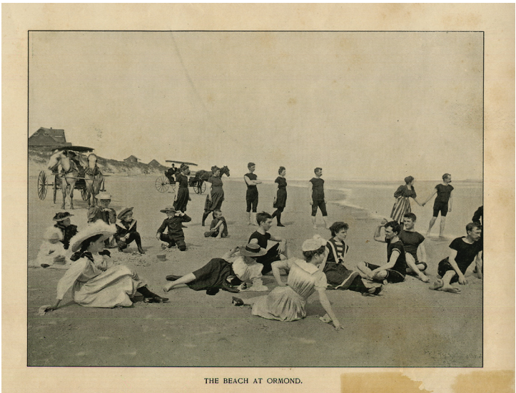
The Beach at Ormond.