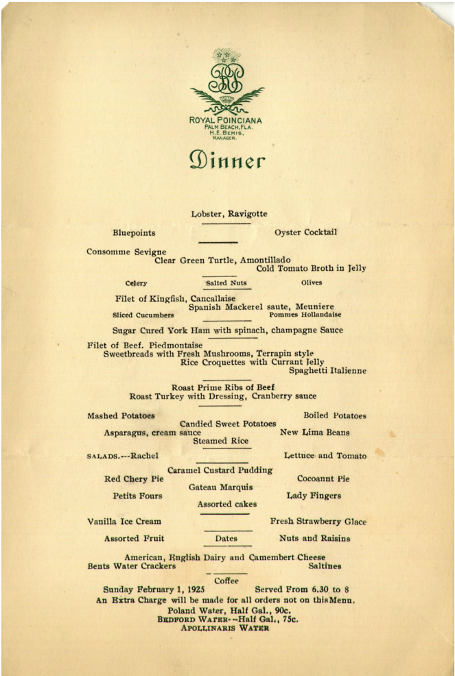
Dinner Menu from the Hotel Royal Poinciana, Palm Beach.