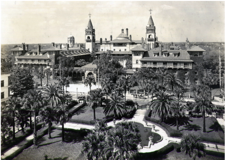
Hotel Ponce de Leon, St. Augustine.