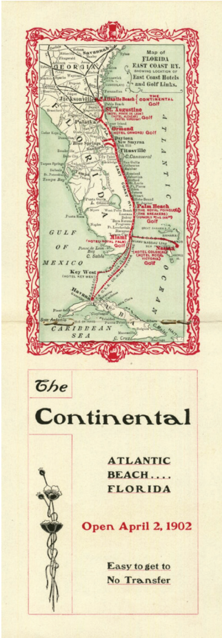
Florida East Coast Hotel Company advertisement for the Continental Hotel, Atlantic Beach, FL, ca. 1902.